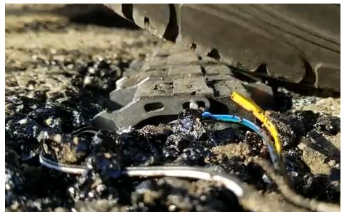
Photos of exposed RPS during operation.

damage by overweight trucks. The data network is designed to integrate with the majority of IT environments such as SCADA systems. Once installed, the plug-and-play devices are fully autonomous and requires low-maintenance. RPS data can integrate with those from visual inspections, manual measurements, cameras, and other toll lane technologies. No proprietary software is used to meet client interoperability standards. Overall, the major advantages of RPS include: